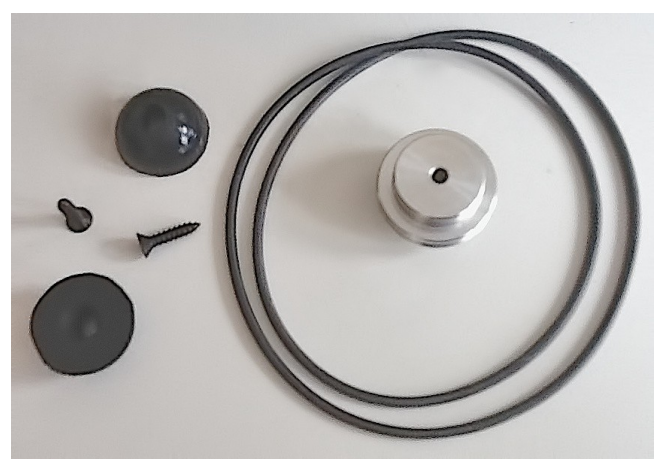
The high quality components in the "S/E upgrade kit"

The Pro-Ject S/E Upgrade Kit is a straightforward solution for fixing the problem of low-level rumble, and is intended to be perfectly doable by anyone able to wield a screwdriver.