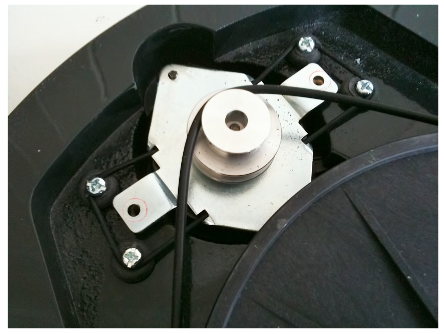
Motor mount - with platter removed

This is pretty simple. It slips straight off by lifting it off of the spindle. When done it looks a little like the following picture. It won't be exactly the same as I've replaced the screws, brass collars and belt with my own parts but it should be pretty close.